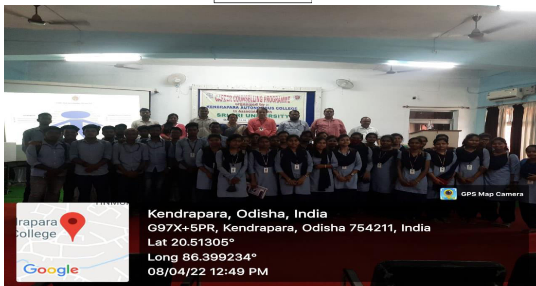
Photo-02, Carrere Counselling Campus organised in association with SRI SRI UNIVERSITY, Odisha