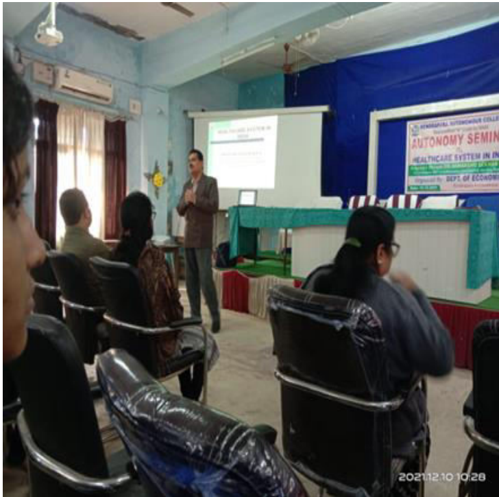
Dept. of Economics