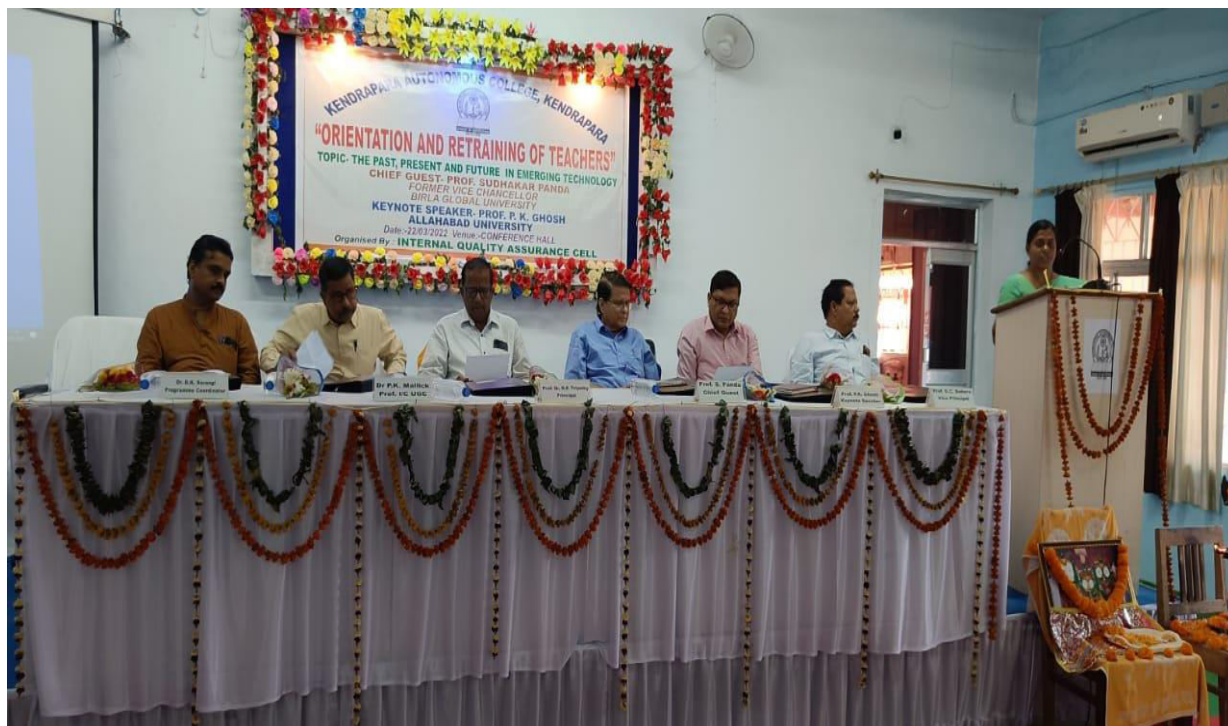
Photo-03, Orientation and Retraining of Teachers