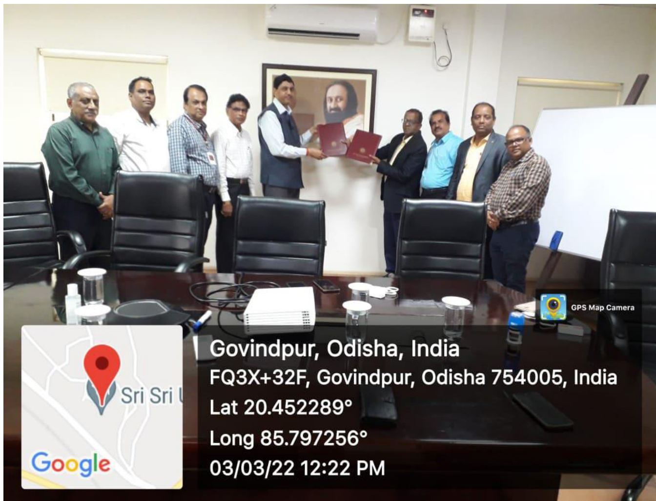
Photo-02, Memorandum of Understanding with SRI SRI UNIVERSITY, Cuttack, Odisha