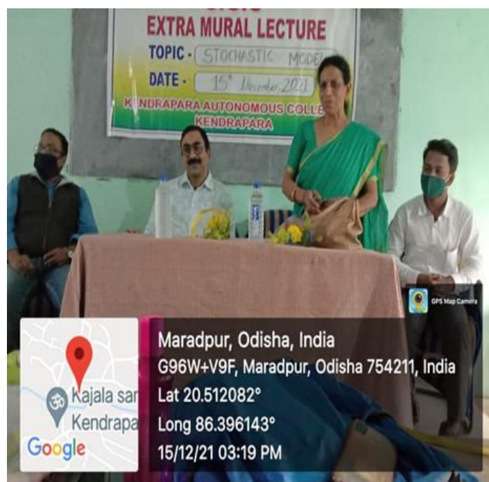
Dept. of Statistics