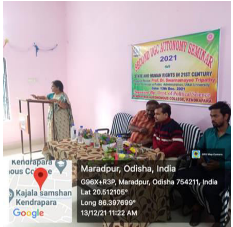
Dept. of Political Science