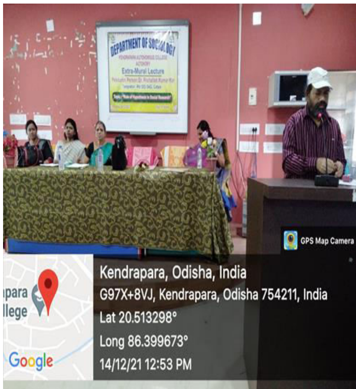
Dept. of Sociology