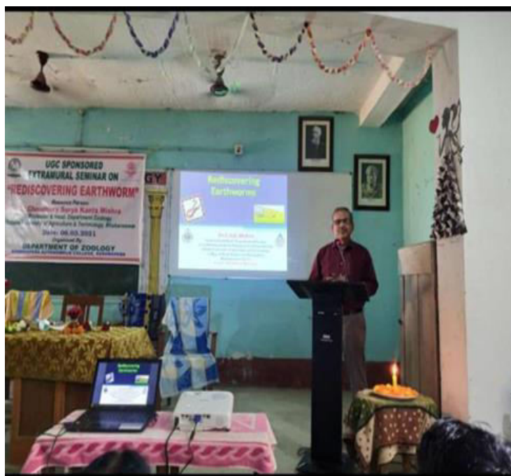
Dept. of Zoology