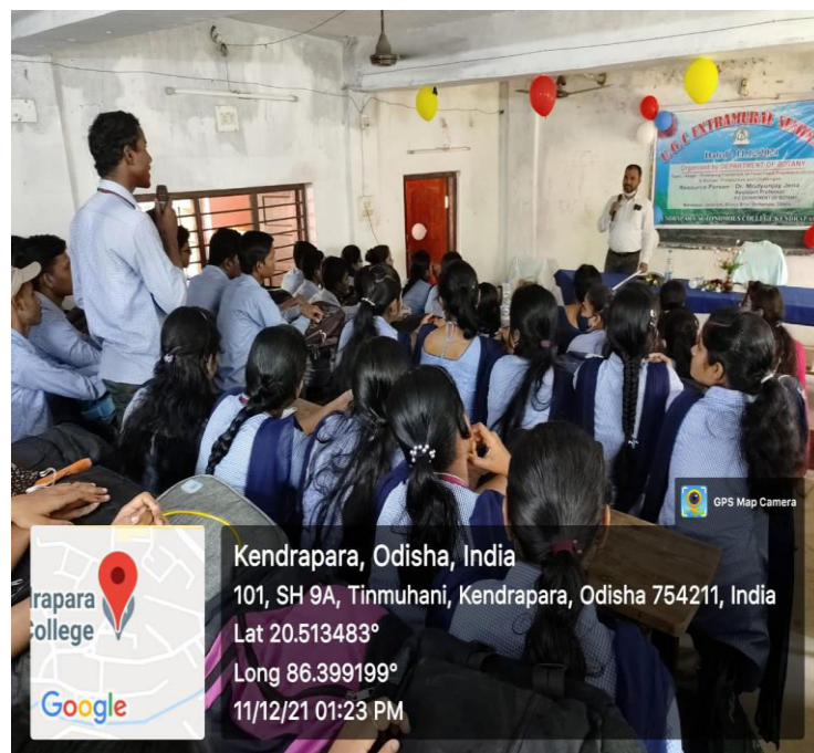
Dept. of Botany