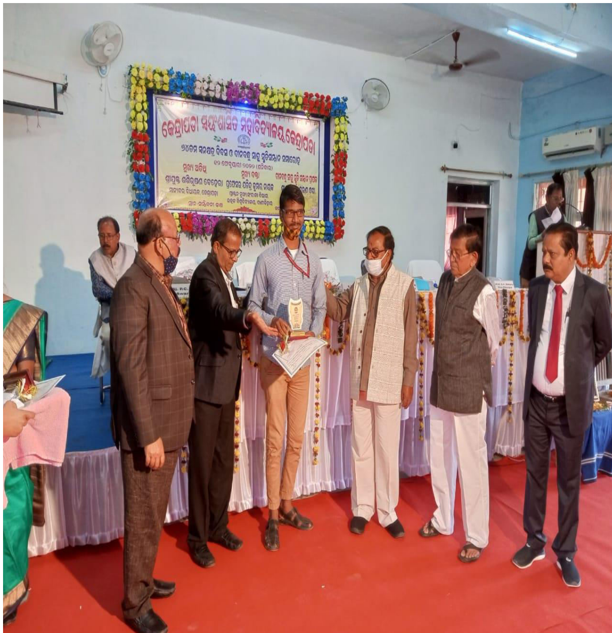
Photo-05, Best graduate Award (Dept. of Physics) Pass out batch-2021