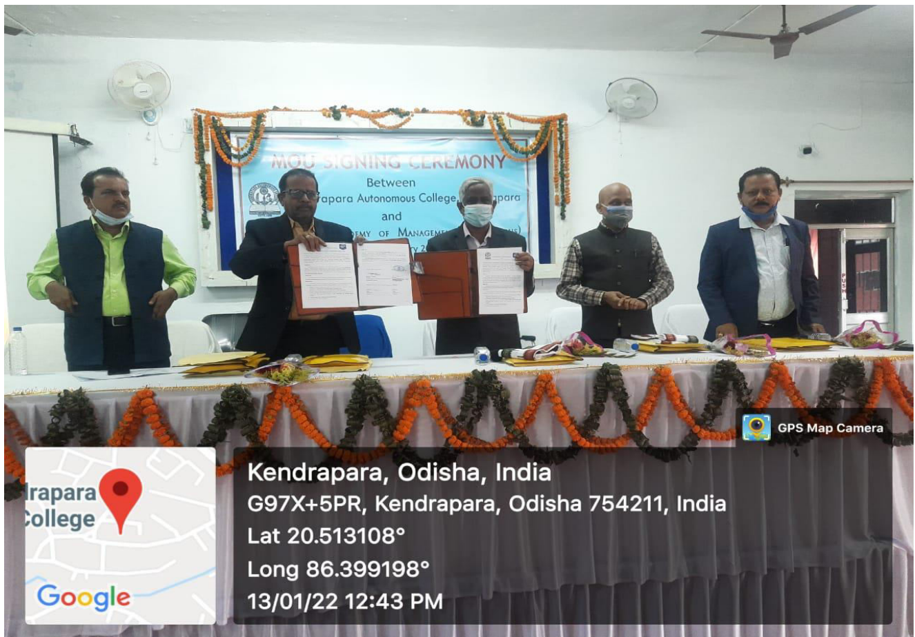
Photo-01, Memorandum of Understanding with Shrusti Academy of Management, Bhubaneswar, Odisha