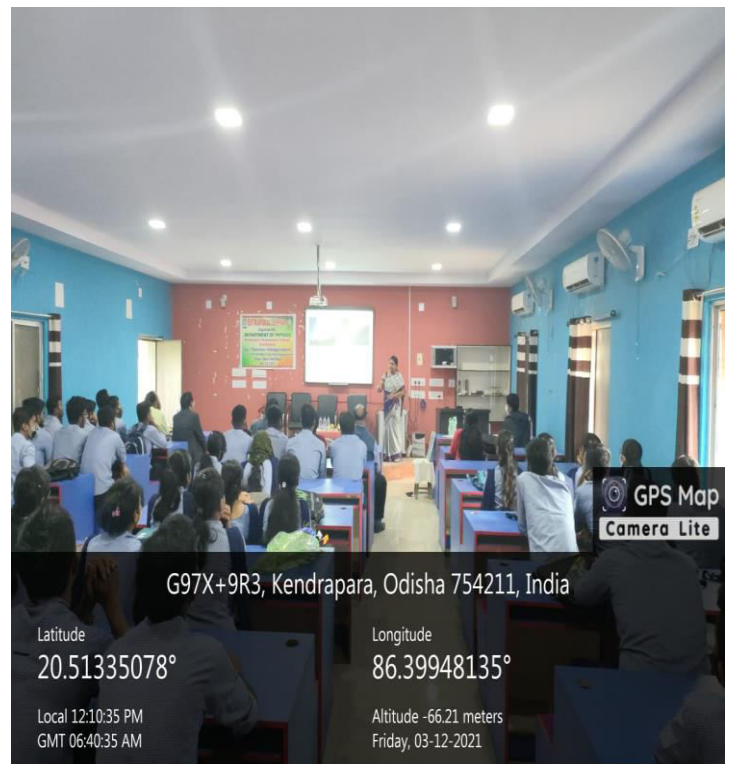
Dept. of Physics